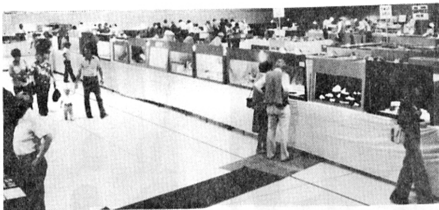
OVERALL VIEW, EXHIBIT AREA, 1979